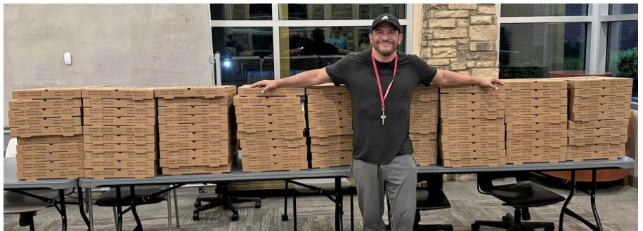
Pizza night fun every night at camp

Primary health insurance is a prerequisite. Camp participants will be covered by secondary accident insurance provided by the camp's tuition. The non-duplicating policy covers medical expenses within the range of its limits, except for those costs covered by any other valid and collectible insurance policies. No one will be admitted to the camp without a signed release and a primary insurance policy. Both must be provided on the application.